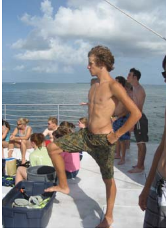
Havre Key Club member and Lieutenant Governor of Div. 8 getting ready to snorkel during International Tour.