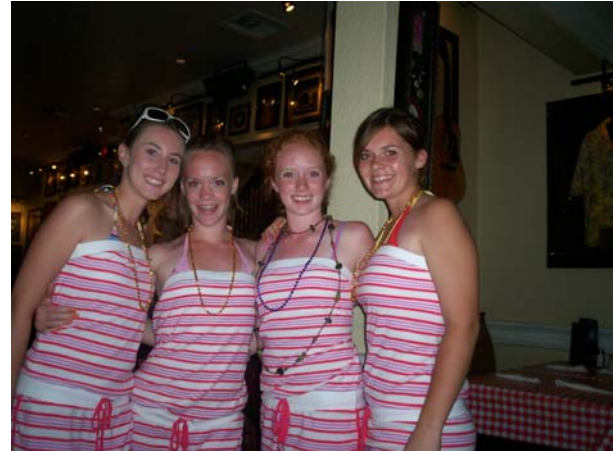
Glasgow Key Clubbers having a fun time on the International Tour. Don't they look cute?

Note to reporters: If you send us pictures with your reports, we can put them in the Mon-Key!